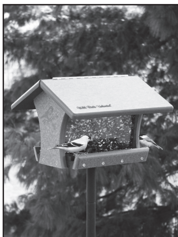
EcoTough Classic hopper feeder with WBU Deluxe Blend

3. Feeding at Both Levels with One Feeder - To attract birds at both levels using one feeder, offer WBU Deluxe or No-Mess Blend in an EcoTough™ Classic hopper feeder. This feeder was designed to accommodate both feeding levels. Elevated-feeding birds will eat the larger seeds at the feeder and knock out the millet and other seeds for ground-feeding birds.