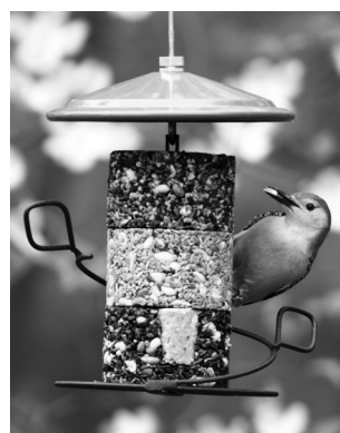
Bark Butter & Feeders

Jim's Birdacious® Bark Butter® has attracted more than 75 bird species, including thrushes, kinglets, wrens and more. Bark Butter is a high-fat, peanut butter-based, spreadable suet that is especially helpful in winter when birds have a hard time finding the insects they normally eat. Our exclusive line of Bark Butter Feeders allow you to add this delicious treat to your existing bird feeding station.