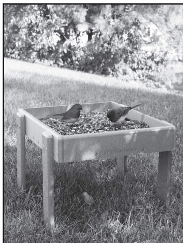
EcoTough Ground Tray with WBU Deluxe Blend

2. Feeding at the Ground Level - These birds often live in meadows and/or fields where fallen plant seeds are a food source. Though millet is the preferred seed of most ground-feeding birds, they will eat other grains and seeds, such as sunflower.